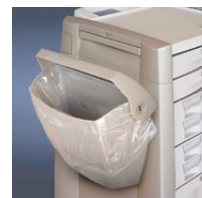
Waste Container with Lid