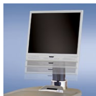
Monitor Height Adjustment