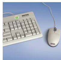
Infection Control Peripherals