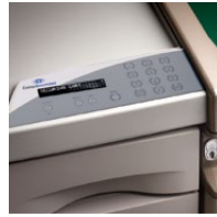
Keyless Access with Auto-Relocking