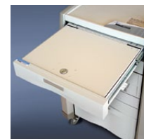
Keyed Narcotics Drawer