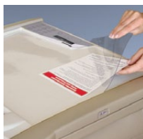
Clear Top Mat