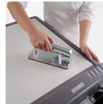
Hard Top Surface