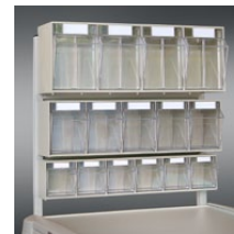
Tilt Bin Organizer