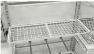
Wire Grid Shelf