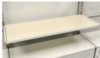
Laminated Particle Board